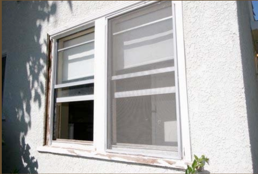
EXAMPLES OF INAPPROPRIATE WINDOW REPLACEMENTS